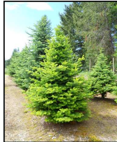
C2 - Subalpine Fir