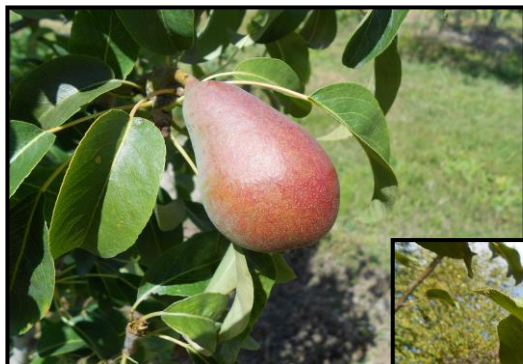
F8 - Anjou Pear