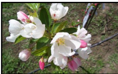
D22 - Donald Wyman Crabapple bloom

NOTE: Look for these in a few years as we replenish our availability!