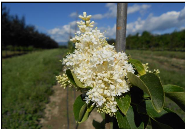
D49 - Ivory Silk Lilac bloom