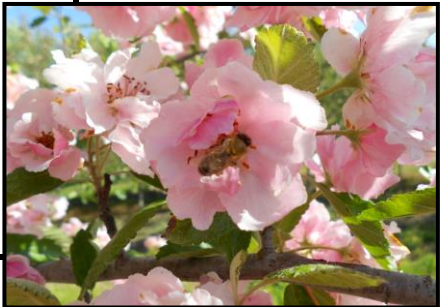
D26 - Prairie Rose Crabapple spring blossoms