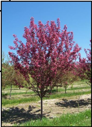
D25 - Perfect Purple Crabapple in spring.