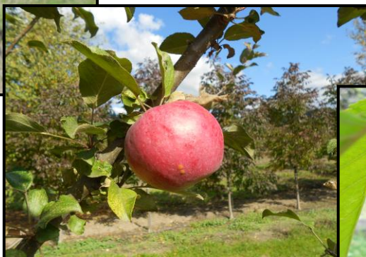
F2 - Honeycrisp Apple