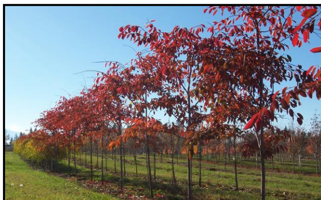
D8 - Autumn Brilliance Serviceberry fall color