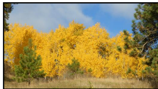
D33 - Quaking Aspen fall color

D33 - POPULUS TREMULOIDES Quaking Aspen - zones 1-6. Height 40-50' Spread 20-30'. Round leaves that flutter in a gentle breeze. Yellow fall color. Fast growing.